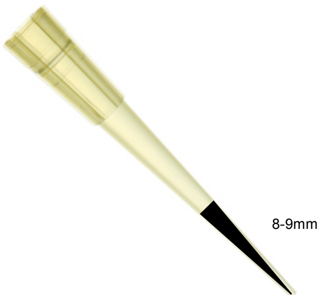
Needle Guide (black)